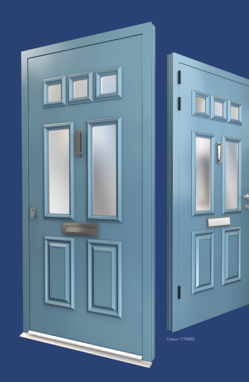
Industry leaders in product innovation, design and technical expertise